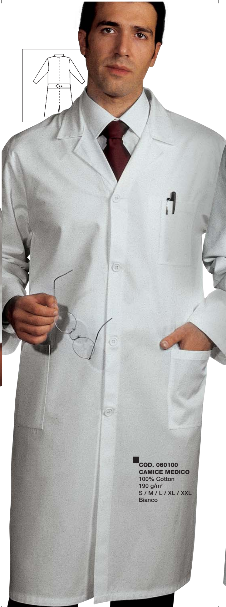
COD. 060100 CAMICE MEDICO 100% Cotton 190 g/m 2 S / M / L / XL / XXL Bianco