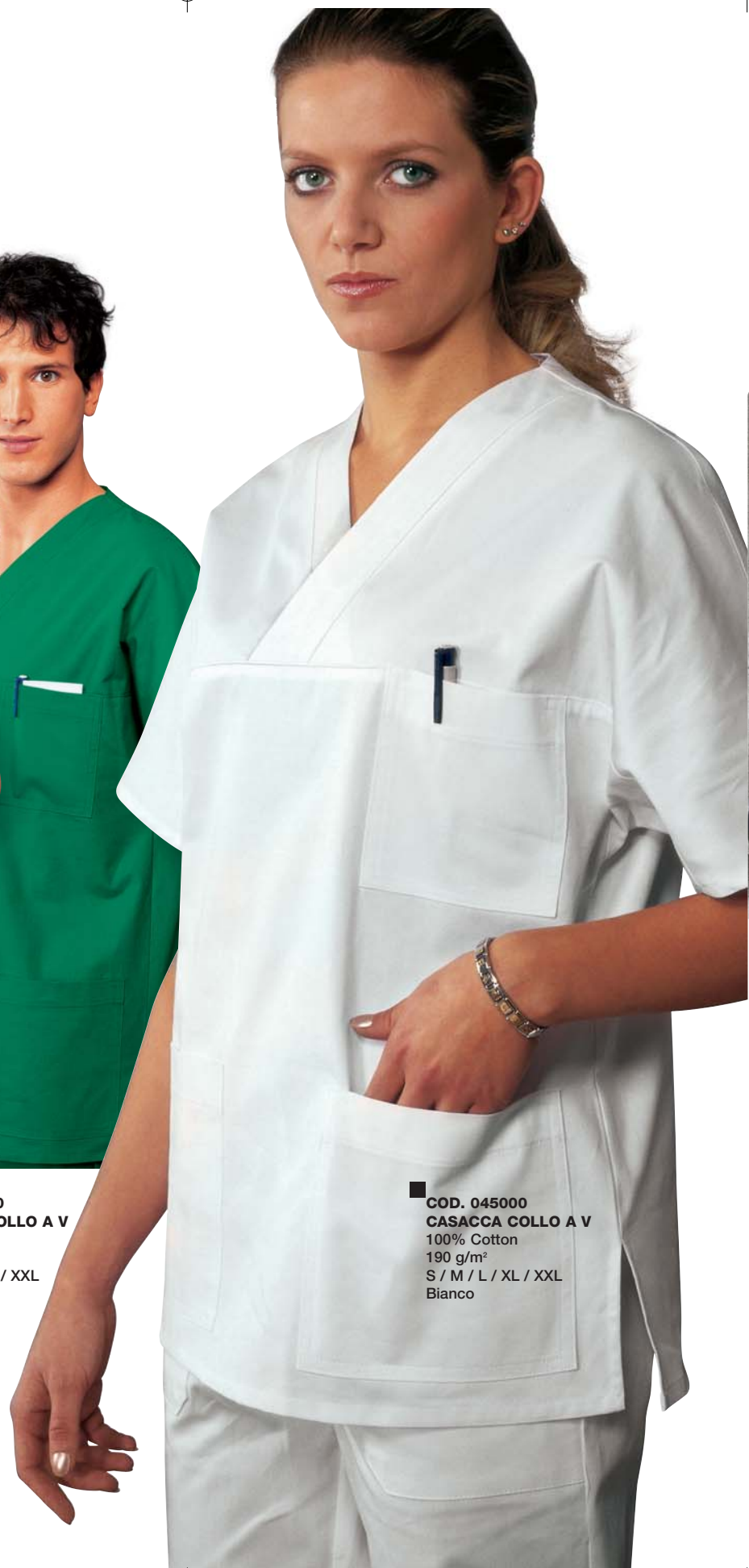
COD. 045000 CASACCA COLLO A V 100% Cotton 190 g/m 2 S / M / L / XL / XXL Bianco