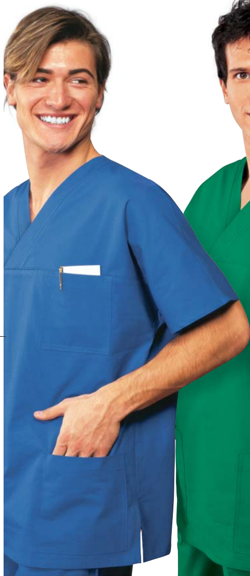
COD. 045400 CASACCA COLLO A V 100% Cotton 185 g/m 2 S / M / L / XL / XXL Azzurro