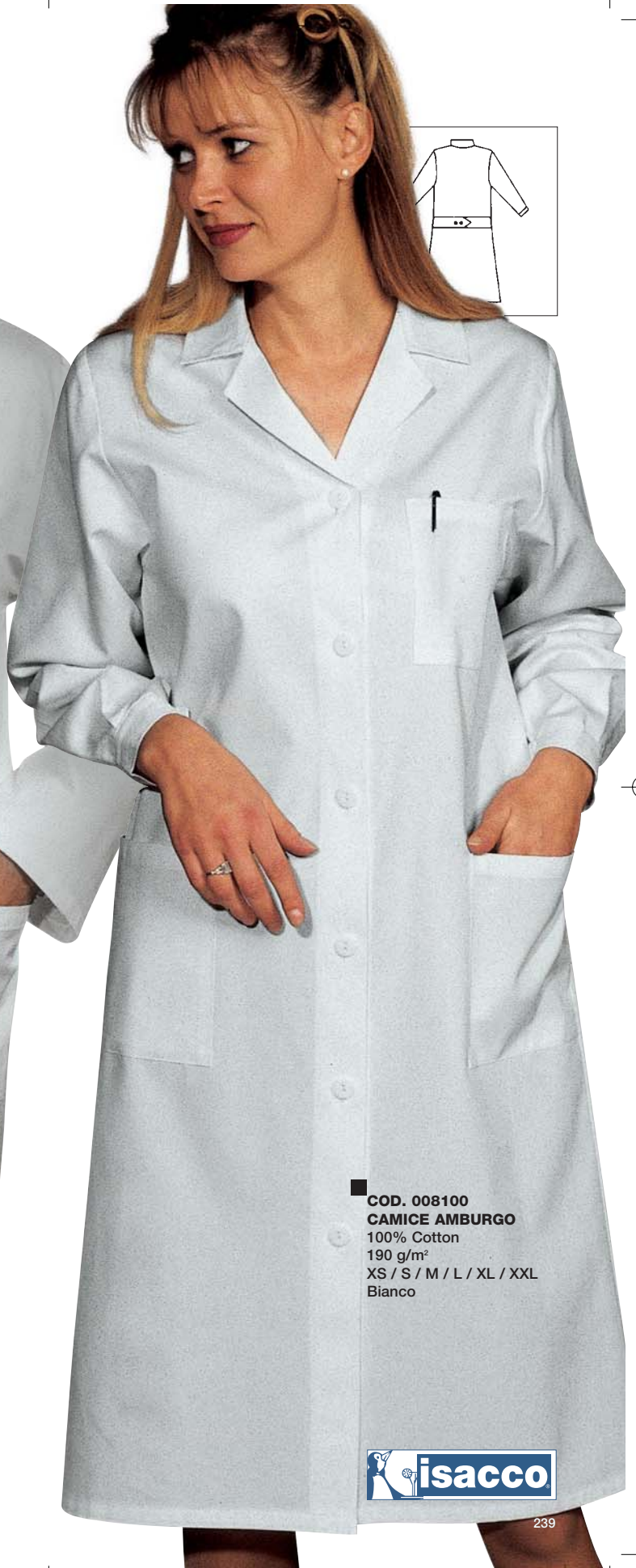
COD. 008100 CAMICE AMBURGO 100% Cotton 190 g/m 2 XS / S / M / L / XL / XXL Bianco