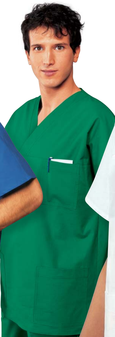
COD. 045200 CASACCA COLLO A V 100% Cotton 185 g/m 2 S / M / L / XL / XXL Verde